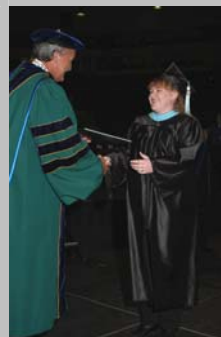
Full Frame & Borderless 4x6

Quicpics 2 Grad Market cropping differs from the traditional Quicpics cropping/printing which are normally cropped equally from the top and bottom. Vertical images printed through Quicpics 2 Grads will be top cropped for all print sizes. The top of the viewfinder will be the top of the vertical print regardless of print size. Place the top of the viewfinder 5" over the top of the tallest subject's head or mortar board for vertical shots. All horizontal images should still be centered in the viewfinder and will be cropped equally from the left and right.